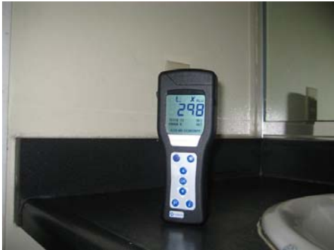
3.1 Small Sink In Men's Room