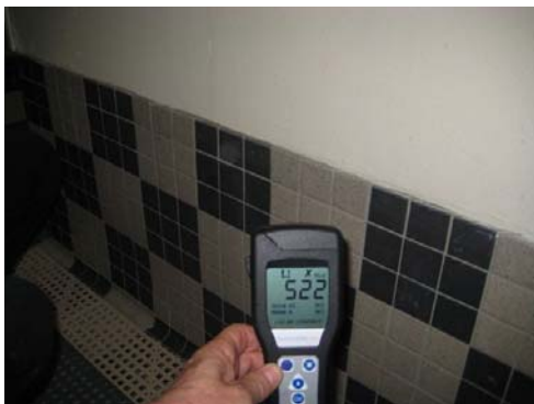
10.1 Hallway Floor Men's Area