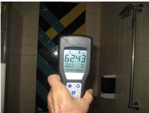
5.1 Men's Shower 1 st on Right