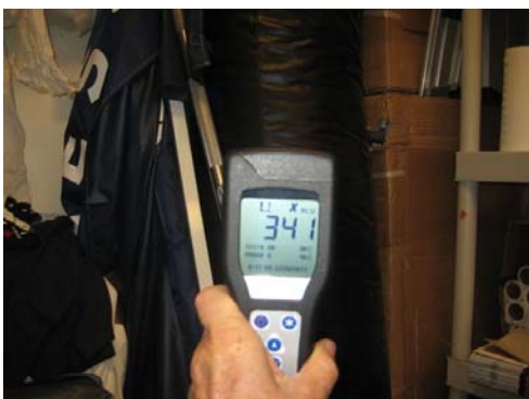
8.1 Seated Lat-Raise Machine